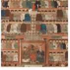
F2721001 Laque de chine